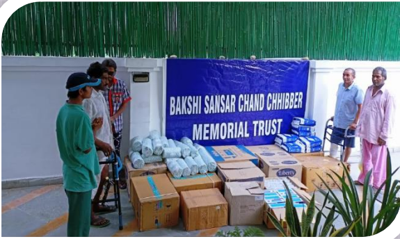
Medicines received for patients