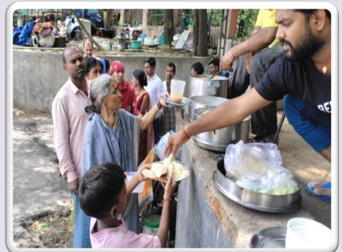
Food Distribution at Safdarjung Hospital