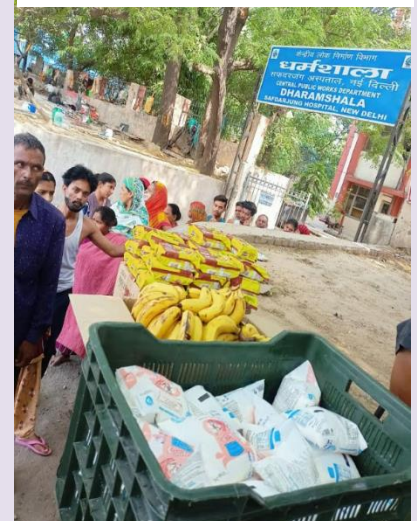
Breakfast distribution at Safdarjung Dharamshala