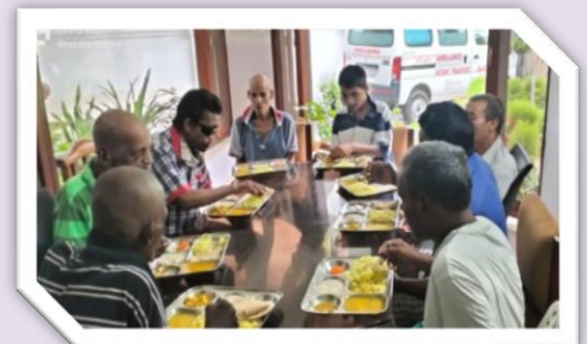
Patients relishing lunch