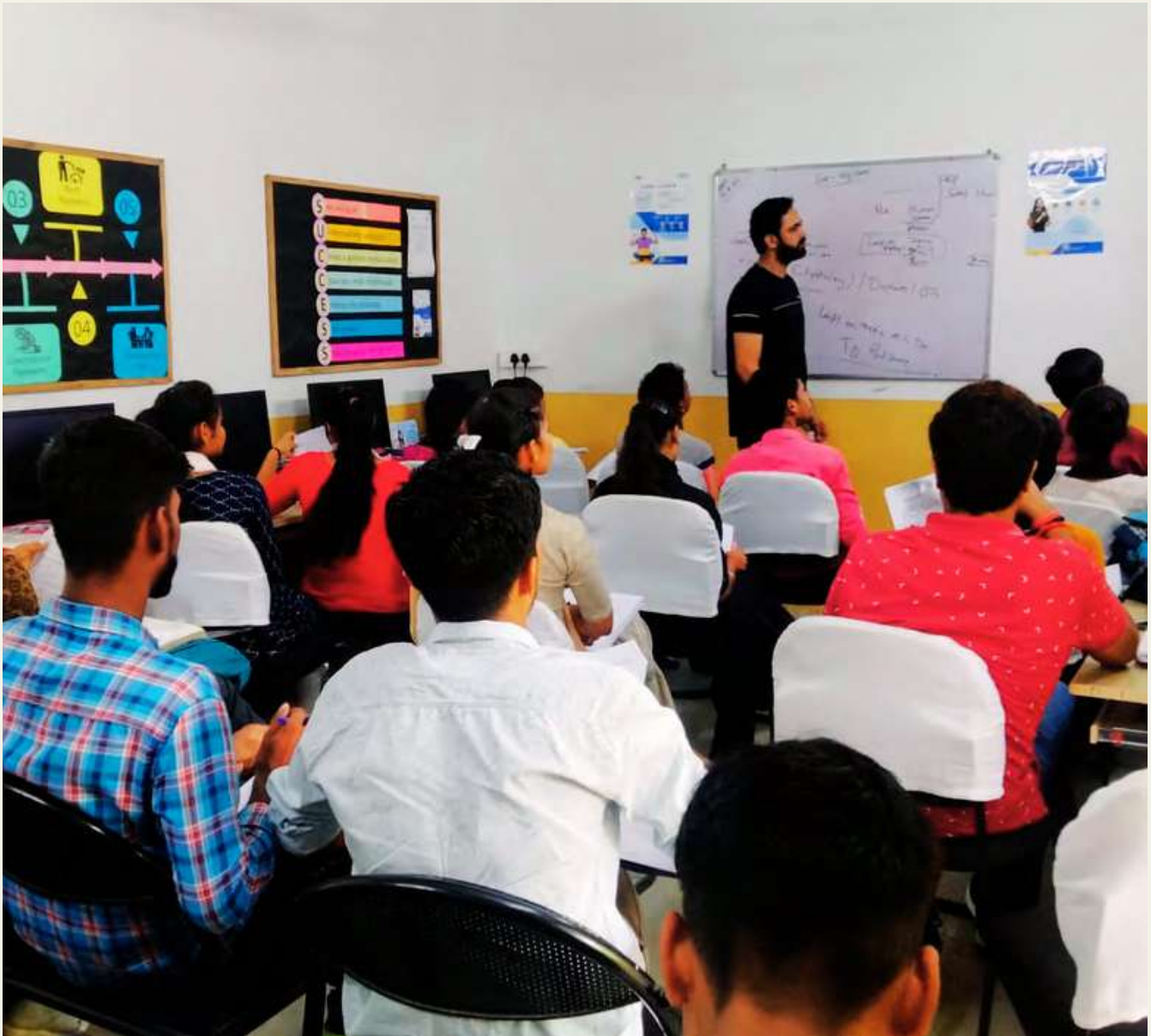
Accounts +GSt Class