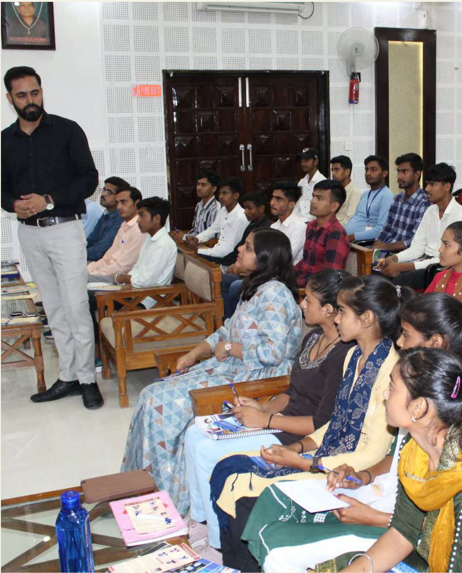
Alwar CA Office Visit