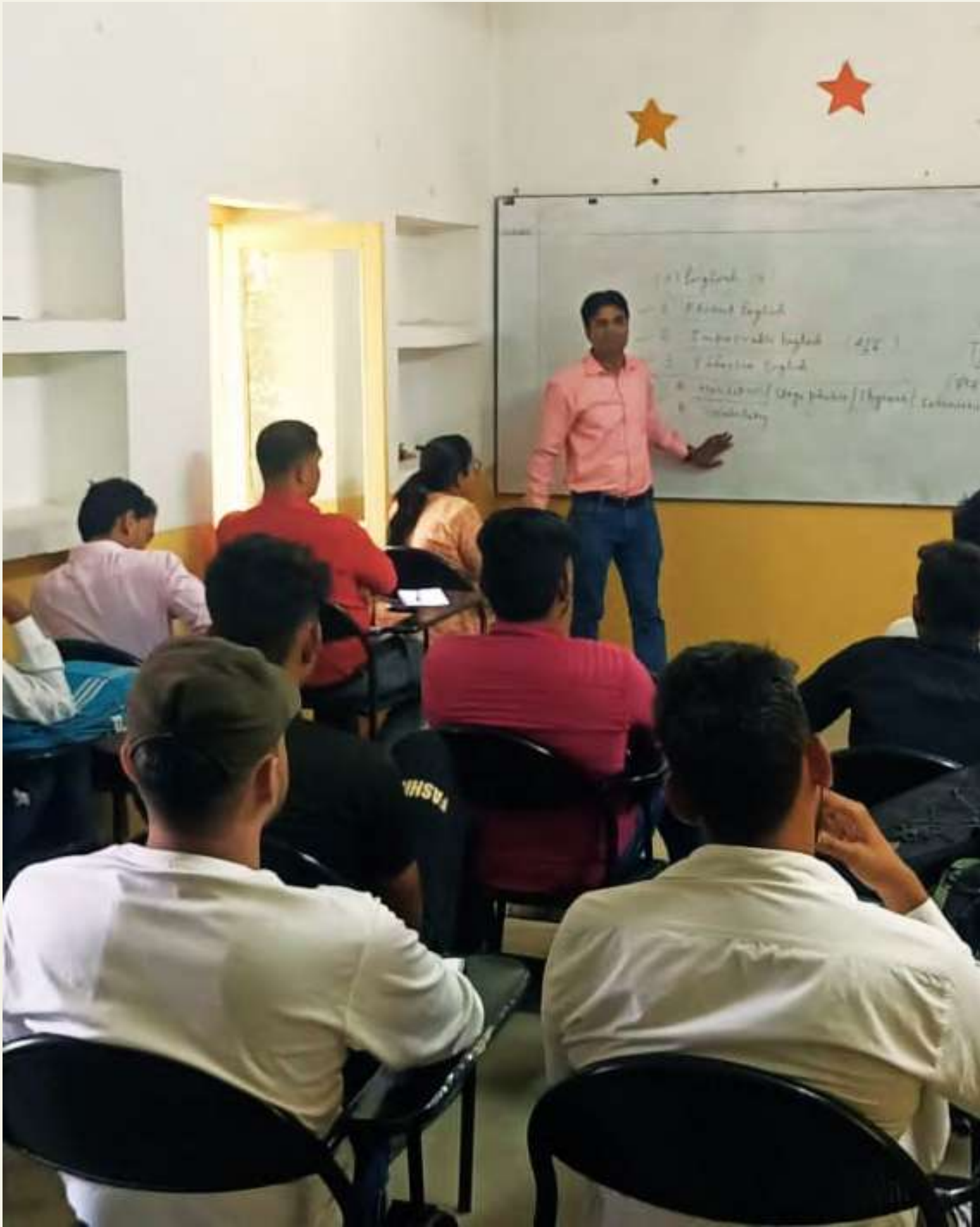
Spoken English Class