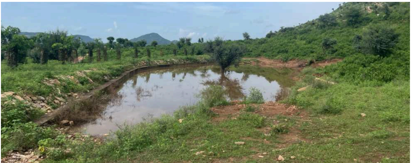
DRI Check Dam at, Dadhikar - 03