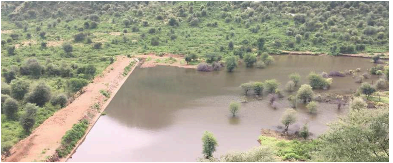
Bry- Air Check Dam at Dadanpeer, Dadhikar- 02