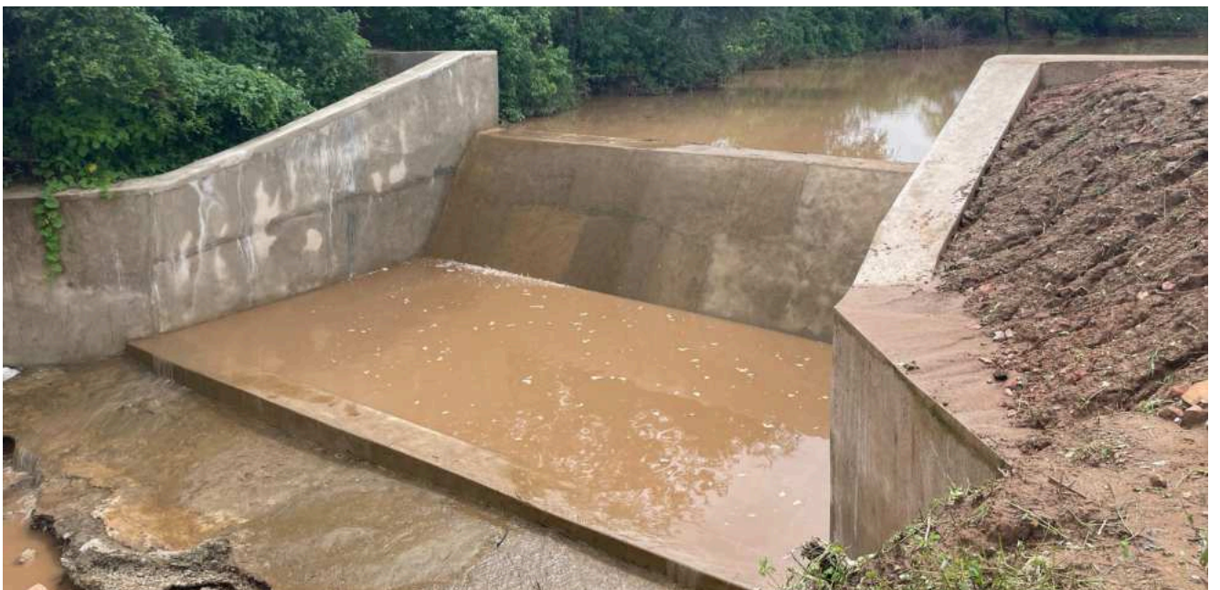
Bry- Air Check Dam at Bala Dahra - 04