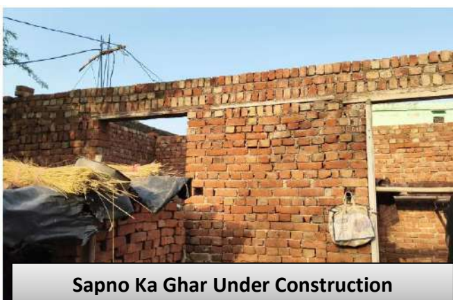
Sapno Ka Ghar Under Construction