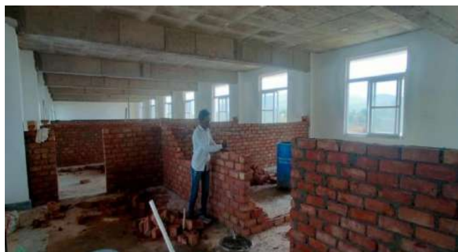
Sapna IT College Construction