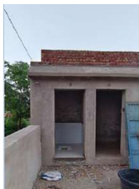
Individuals Toilet Construction in Villages