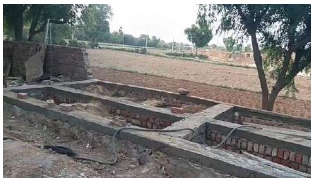
Toilet Block in Mahatma Gandhi Netralaya