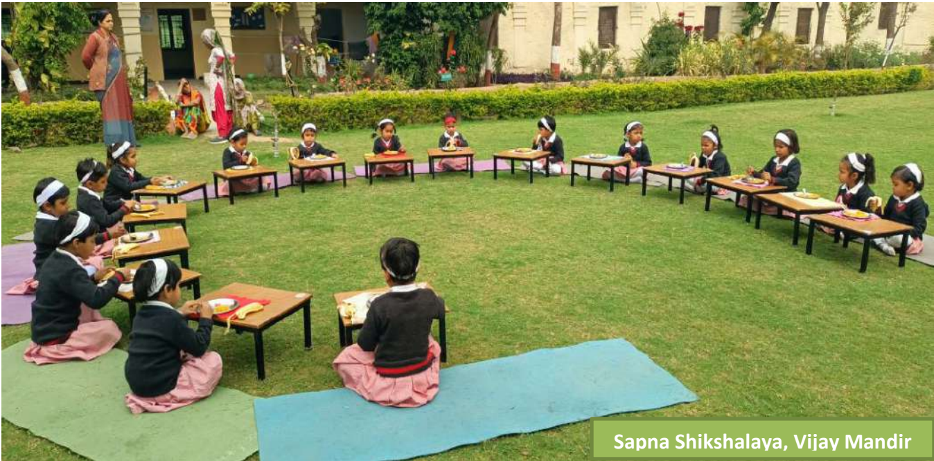
Sapna Shikshalaya, Vijay Mandir